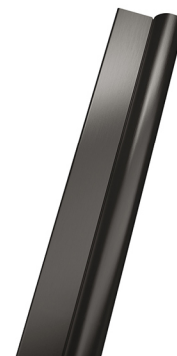
Chrome noir brossé N