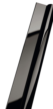
Chrome noir brillant L