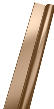
Bronze brossé Q