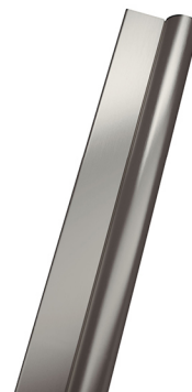
Inox brossé Z