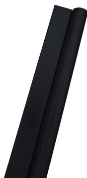
Noir mat H