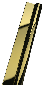
Or brillant O