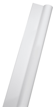
Blanc mat U

FINITION DES PROFILÉS N180 - KUADRA H - H ART