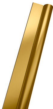
Or brossé P